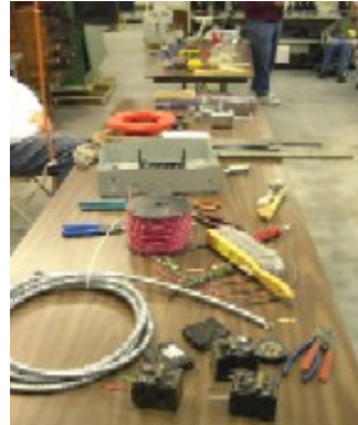
Supplies for a wired workshop