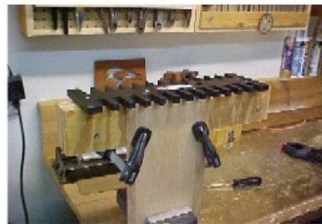
Jig set up