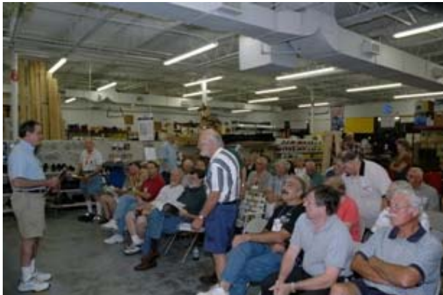
President Ford updating the club