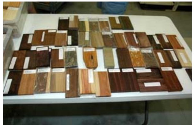
Some of Scotty's collection