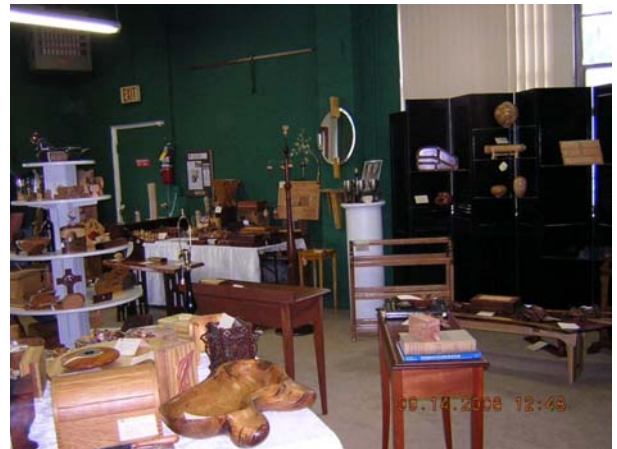
Some of the works in the gallery are by TWA members.

East Wake Gallery http://eastwakegallery.com/ adjoins the wood sales and shop area. Works from many NC master craftsman are for sale.