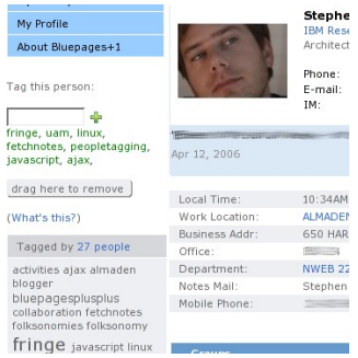
Figure 4. Part of Fringe3 corporate directory, a client of Fringe Contacts API

with which the tag was used), and a way to see who someone's contacts are.