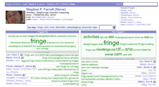
Figure 1. Fringe Contacts Web User Interface