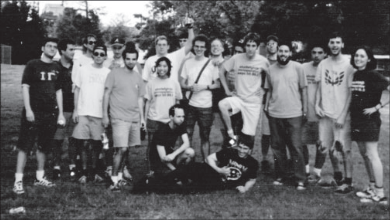
The winners of the WXYC-WXDU kickball match.

WXYC 89.3fm Box 51 Carolina Union Chapel Hill, NC 27599