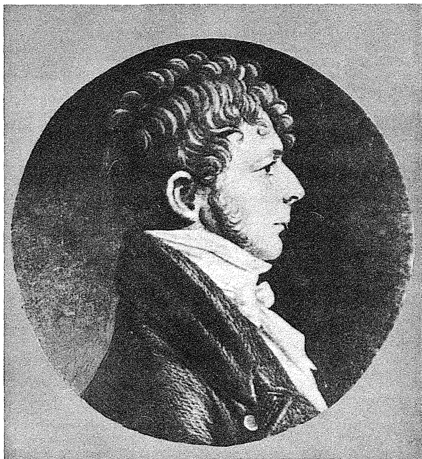
LIEUTENANT ANDREW STERETT, U. S. NAVY.