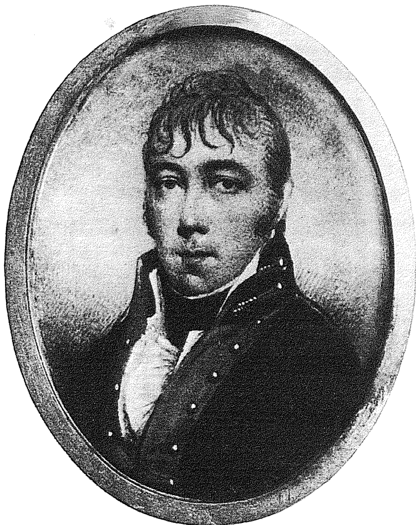
LIEUTENANT WILLIAM BAINBRIDGE, U. S. NAVY.