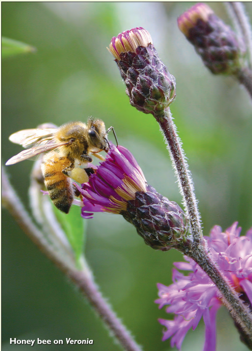
Honey bee on Veronica

When my wife enrolled me in the recent Chatham County Center, North Carolina Cooperative Extension/Chatham County Beekeepers' Association's eight-week beekeeping school, I unenthusiastically consented, declaring, "How in the world can it take eight weeks to learn beekeeping?"