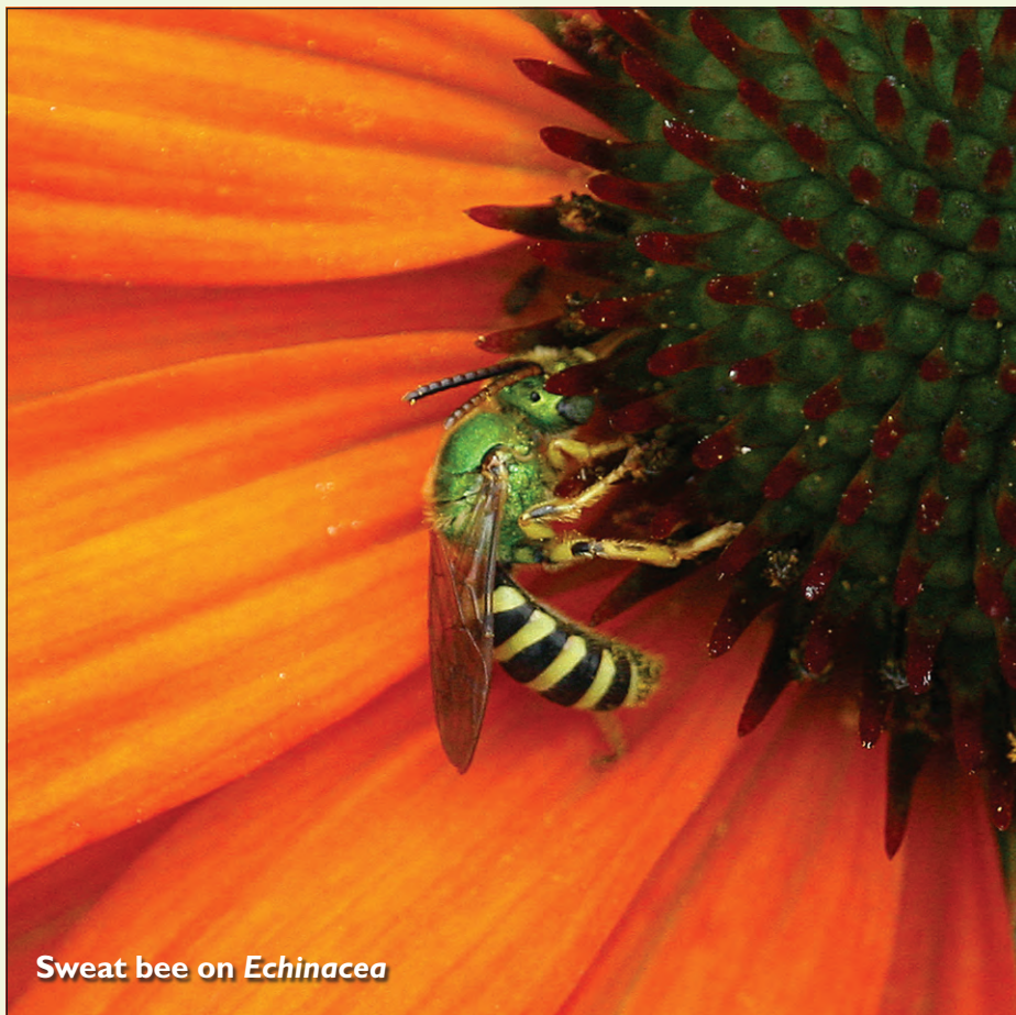
Sweat bee on Echinacea