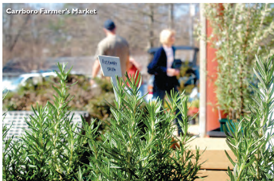
Carrboro Farmer's Market

Fresh, naturally grown produce, prepared foods.