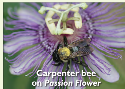
Carpenter bee on Passion Flower