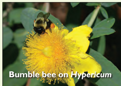
Bumble bee on Hypericum