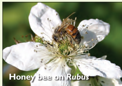
Honey bee on Rubus