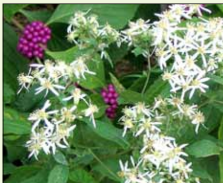
Heart-leaved aster with beauty berry