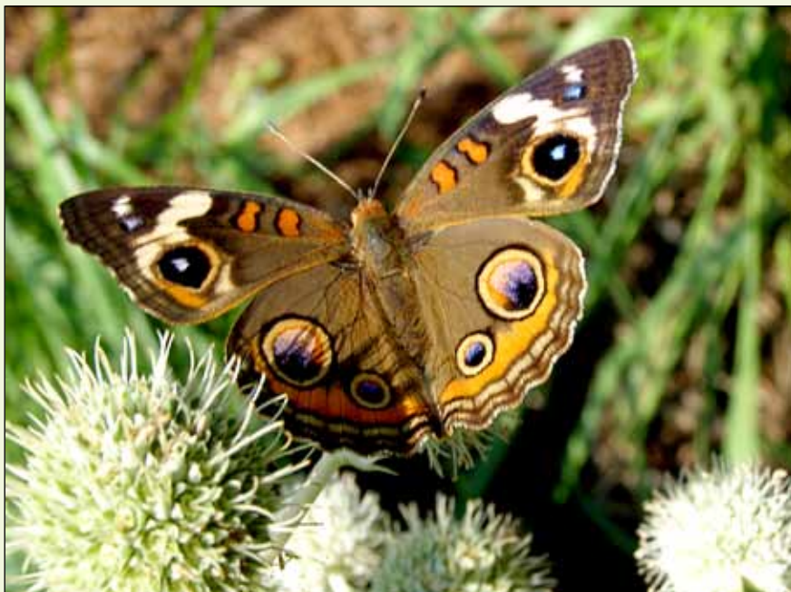
Rattlesnake master with common buckeye butterfly