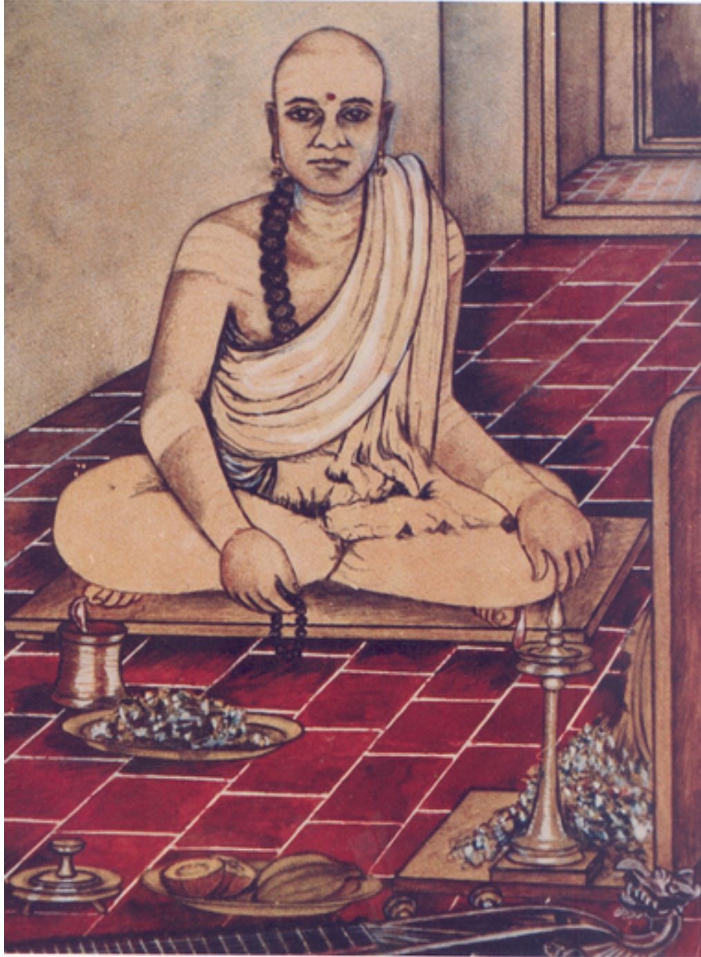
śrīmad Muttusvāmi Dīkṣitar