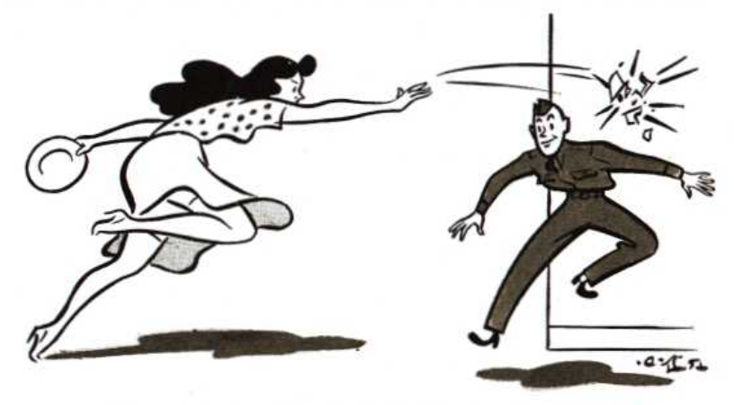
RECOMMENDED: A GOOD FIGHT (NOW AND THEN)

Some advisers recommend a quarrel now and then. It is human, it helps to clear the air, and it may test a couple's ability to adjust conflicts of interest and will. The person who will never admit that