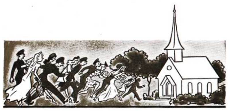
IT STARTED RIGHT AFTER PEARL HARBOR . . .

These are but a few glimpses of changes brought to courtship, marriage, and family life by the war. Most of us see only a swift series of episodes, not the whole picture, along with the rush of events.