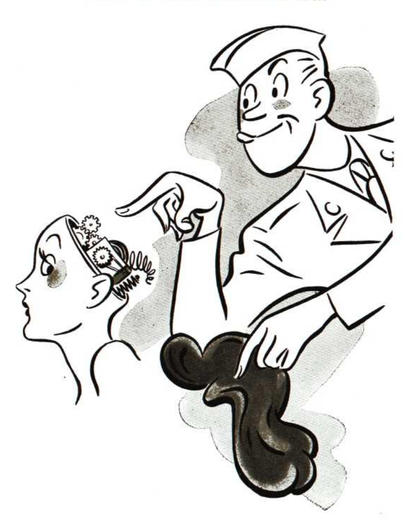
BUT DON'T TRY TO CHANGE HER