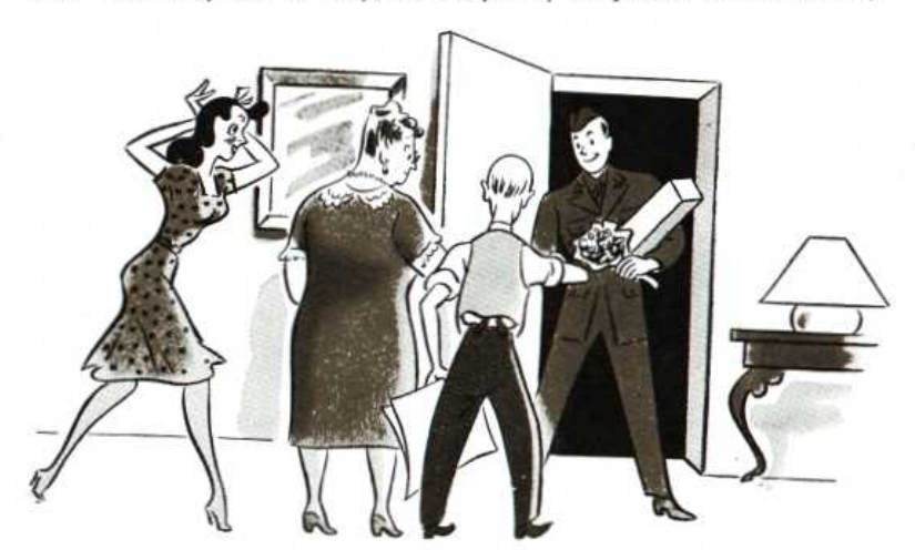
MEET THE GIRL'S PARENTS . . . STUDY THEM!