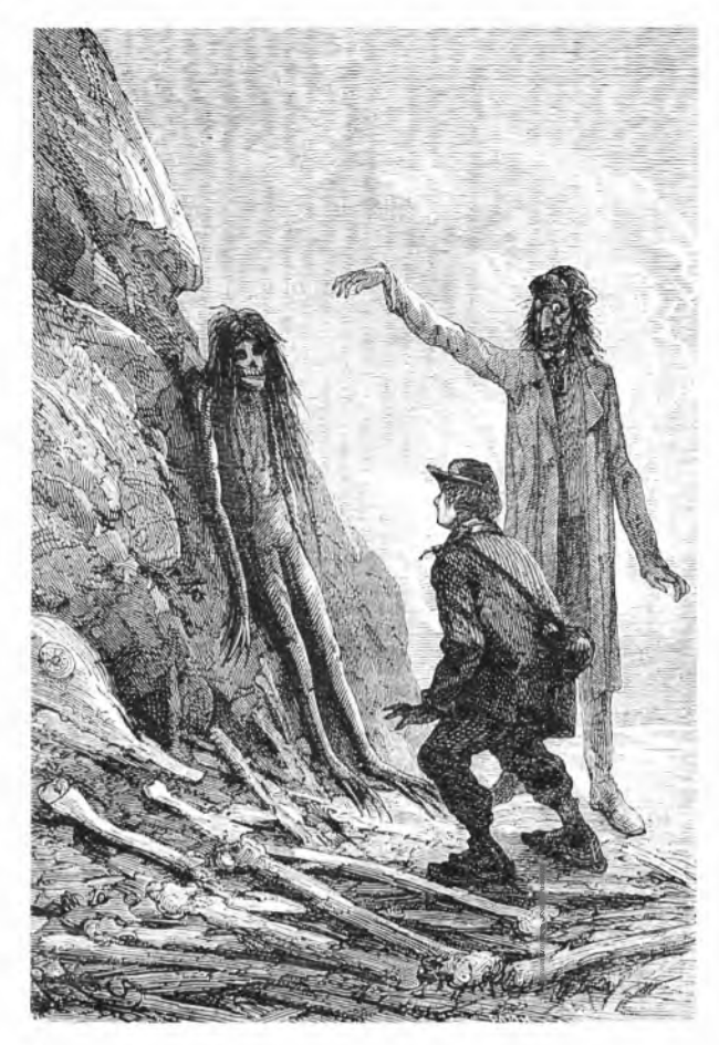
Figure 2. "A perfectly recognisable human body," by Riou, in ch. 37 of Jules Verne's Journey to the Centre of the Earth (1864, 1867).

déluge (pp. 326–328 and 340–342), although Figuier makes more explicit Peter Camper's role in the controversy over Scheuchzer's pre-Adamite witnesses of the Flood. At the same time, Verne entertains the reader by a variety of literary devices, such as employing Axel's point of view to mock Lidenbrock's over-academic style. In sum, this passage would on its own provide conclusive proof that Verne borrowed from Figuier in writing the novel.