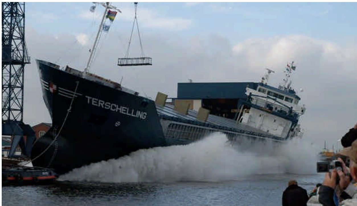
At the FERES SMIT shipyard along the Winschoterdiep the TERSCHELLING was launched

VLIERODAM, STRONG QUALITY IN LIFTING AND HOISTING EQUIPMENT.