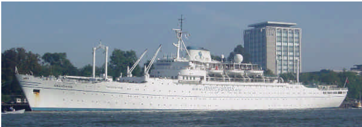
Mercy Ships 522-foot flagship Anastasis

Hi-tech ships bring grace, healing to the 'unspeakably' disfigured