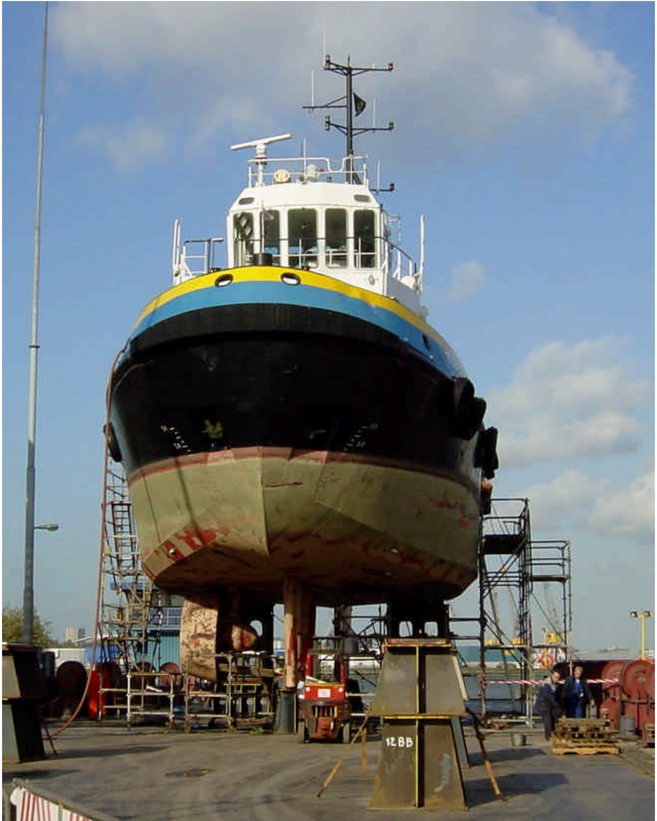
Smit Harbour towage THAMESBANK at the synchrolift in Rotterdam