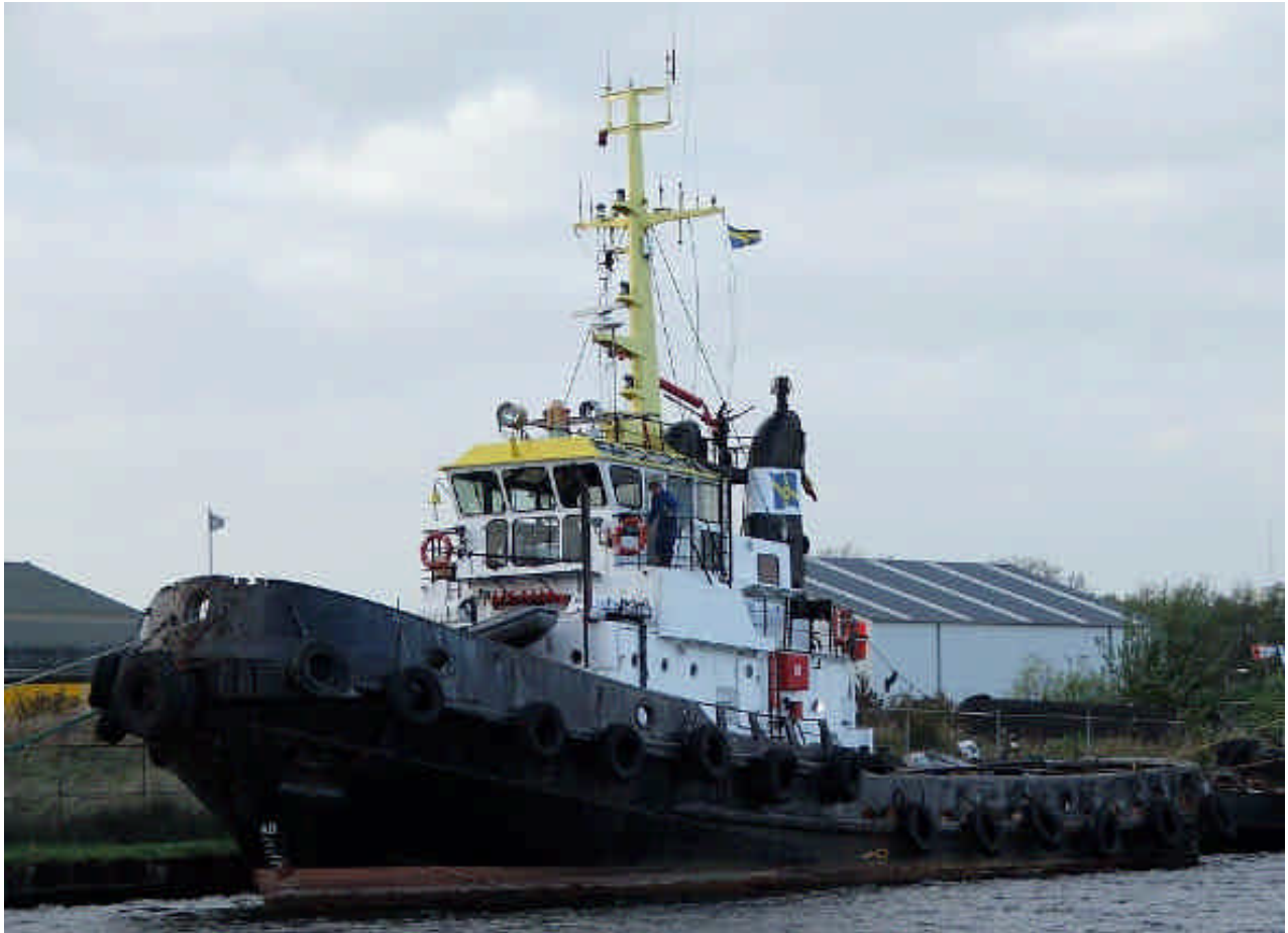
The MULTRATUG 25 is the former URS tug WESTHINDER