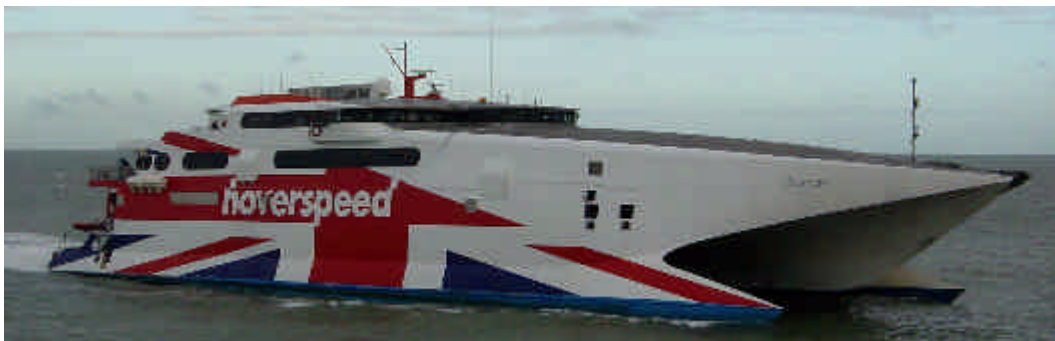
Boven : The catamaran ferry DIAMAND aankomend in Calais

Scheepvaartmaatschappij Hoverspeed stopt de snelle catamaranverbinding tussen Calais en Dover. Dat heeft de moedermaatschappij Seacontainers bekendgemaakt.