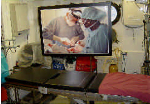
Left : The operating theatre onboard the Anastasis

Last year, Mercy Ships rapidly responded to the Asian tsunami by shipping nearly $400,000 worth of donated relief supplies within days of the disaster. As the scope of the devastation became clearer, Mercy Ships made a long-term commitment to the region, which included providing boats to the fishermen who lost more than 23,000 vessels.