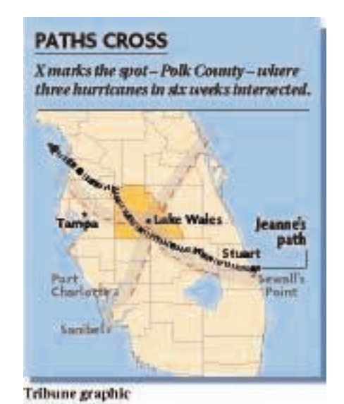
X Marks the spot where in Polk County, Florida, just miles from Tampa, three hurricanes in six weeks intersected. Map: Tribune Graphics.

Now with thousands of volunteers from the Red Cross, Federal and State agencies, as well as electrical workers and clean up crews from all over the United States here to help, they and Floridians were at risk again, when nine days later, the fourth hurricane Jeanne hit: Jeanne, a Category 3 storm that killed more than 2,000 people. Most of those were Haitians, but an additional 8 were killed in Florida—the victims of the most active hurricane season on record. At no other time, have so many hurricanes hit one region in such close proximity to one another.