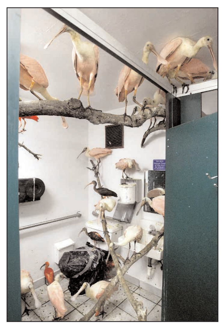
In preparation for Hurricane Frances, officials at the Dreher Park Zoo in West Palm Beach moved these spoonbills and ibises into the women's restroom at the parK.

We have three daily newspapers here and all three buildings were hit very hard. Many employees no longer have homes or power. The power just came back on after two weeks. I just got back to my office today (September 20) for the first time in almost three weeks. It had been unsafe to enter. The inside is all torn apart due to rain and now mold damage. The printing facility where I was working when the hurricane hit—an entire seven story wall blew out in the room next to me. The sound was so loud I thought it was a car hitting the roof. A selected staff worked trying to get