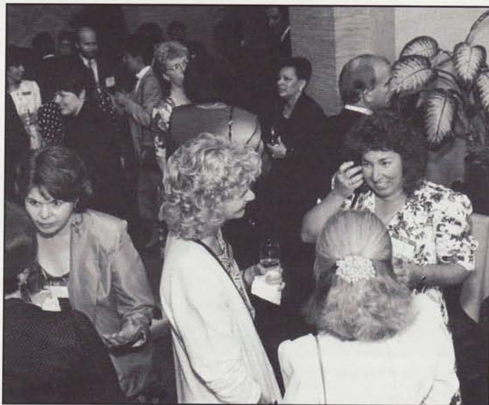
Conference attendees renew old acquaintances and make new friends in Cincinnati.