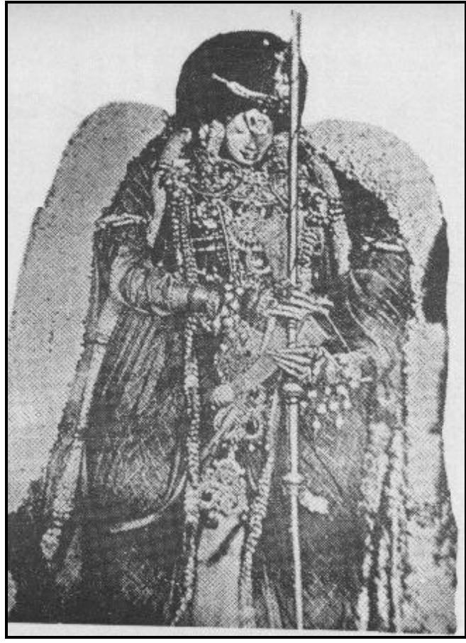
Sundarrajar, kallazhagar temple

Location: Azhagar Koil, 21 km north of Madurai, is placed atop a picturesque wooded hill called Azhagar malai/hill and has many beautiful sculptures of Vishnu / Sriman Narayana. Madurai is a major city, whose Airport is connected with Chennai, Bangalore and Tiruchirapalli. It is also a major train junction connected with important cities of Tamilnadu and is also well connected by road.