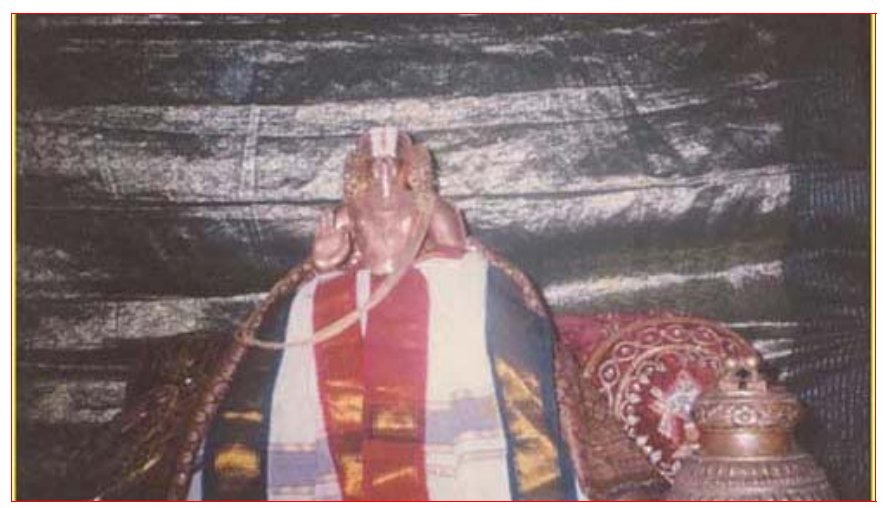
Swami Kurathazhvan, Kooram

The festivals listed are based on the calendar that is followed in Thiruvallikkeni (Triplicane, Tamil Nadu). Festivals are shown based on the time in India, and as a result, may not necessarily represent the date the festival falls in the US and other countries. Please contact your Acharya or a temple priest to determine the exact date and time of a specific festival.