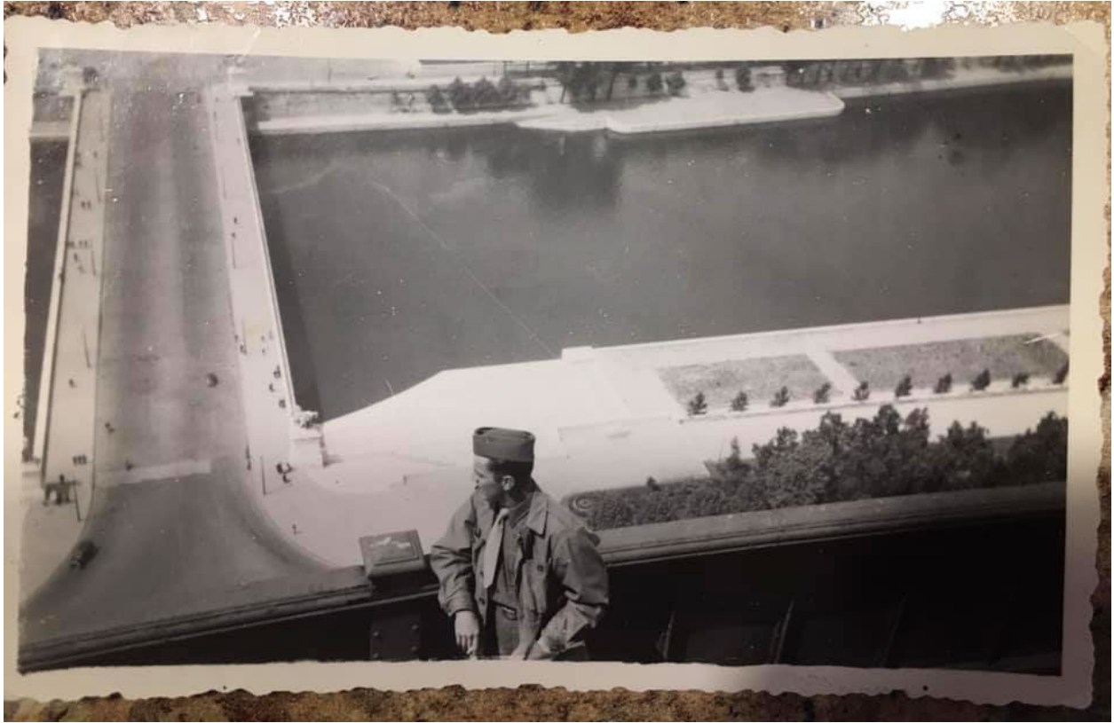
T3 King possible in Paris gazing at the Seine River