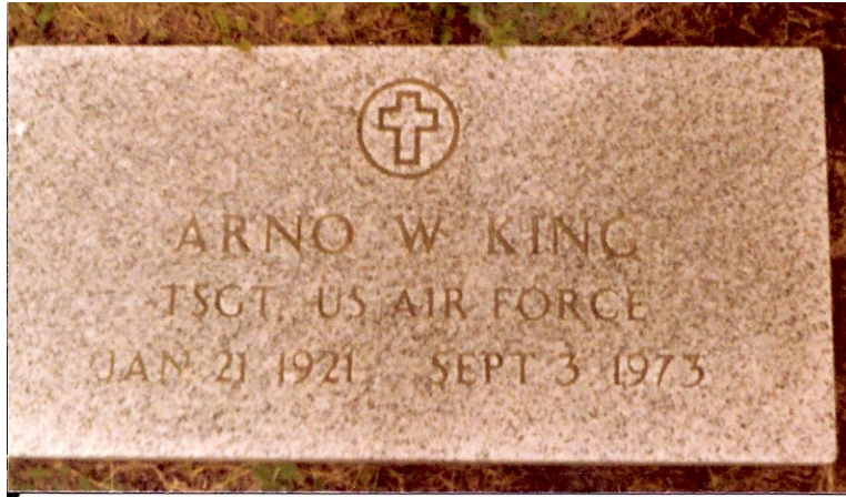
Gravestone, Woodbine Cemetery Ellsworth, Hancock County, Maine