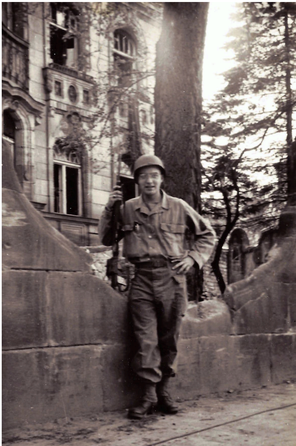
Furth, Germany, May, 1945